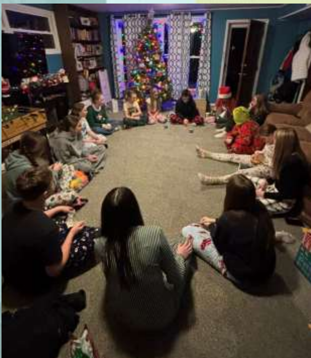
Youth Christmas Party

March 30 through April 3 - Cabell County Spring Break