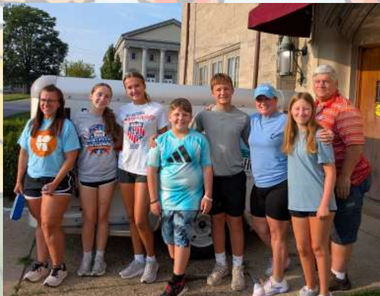
Youth Group doing mission work (taking donated flood bucket kits to Vision Depot)

December 14 - Winter Break (Breaking for Christmas!)