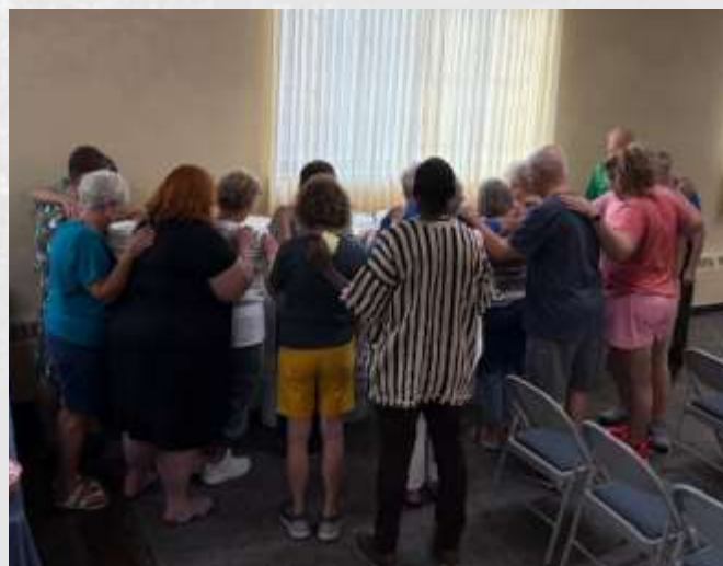
Flood Bucket Filling 7/23/2025

We are deeply grateful to everyone who contributed! Your compassion and commitment to serving others truly shines.