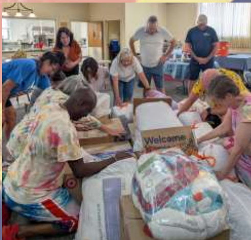
Bedding in a Backpack 6/25/2025