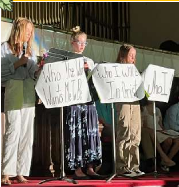
A big round of applause to the Youth for their performances on Youth Sunday! If you missed it, you can watch the recording of it on our Youtube page!

Middle & High School camp is June 30 - July 4 th at noon .