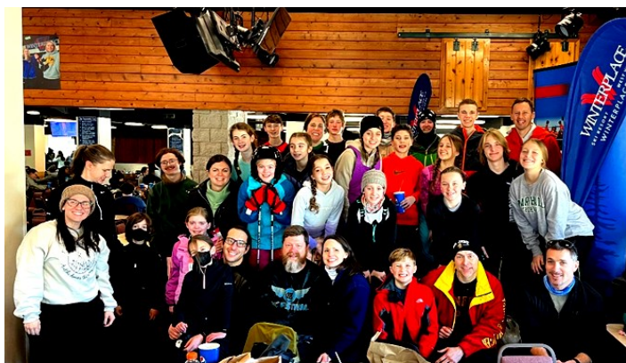
Below: It was all smiles at the slopes of Winterplace with the youth!