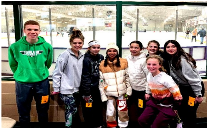
Above: Youth members enjoyed a great afternoon ice skating in Charleston.

Vacation Bible School is in need of 20 more volunteers. You can sign up as a volunteer or a participant on our Facebook page and we have forms ready in the back of the sanctuary as well. The Dates are June 4 th -and 5 th .