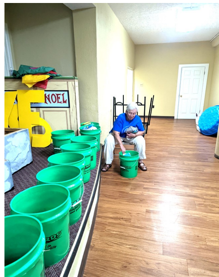
FLOOD BUCKET HELPERS ON AUGUST 10. THEY FILLED 36 BUCKETS IN 34 MINUTES